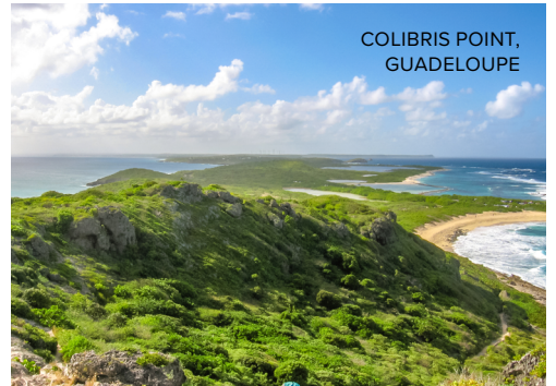
COLIBRIS POINT, GUADELOUPE